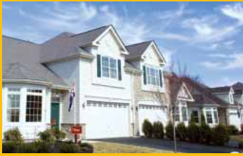
Delaware Crossing at Morris Park