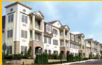
The Village at Whitehall