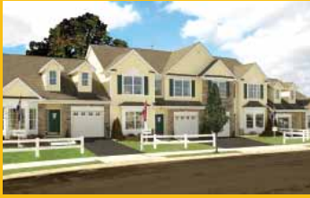
The Village at Maidencreek